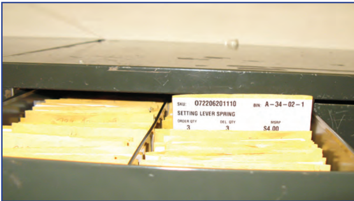
Figure 8: PARTS STORAGE