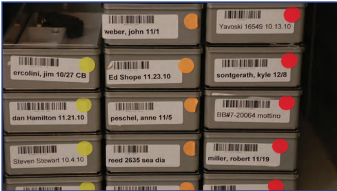
Figure 4: BAR-CODED STORAGE SYSTEM