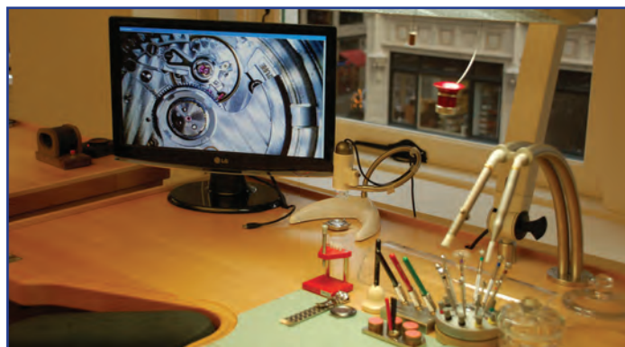
Figure 5: SHOP TECHNOLOGY

Nesbit says it's sometimes tempting to fight change,