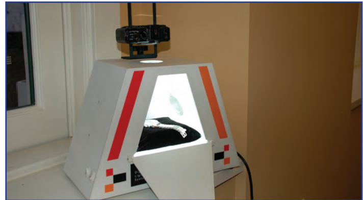
Figure 6: MODERN PHOTO BOX

business," adds Nesbit. "It may be hard to swallow when the purchase is being made, but the long-term result is more money in your pocket. (See Figures 6 and 7.)