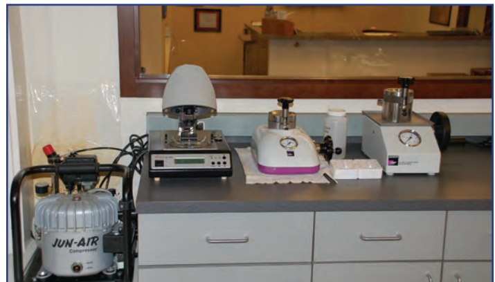
Figure 3: TESTING AREA