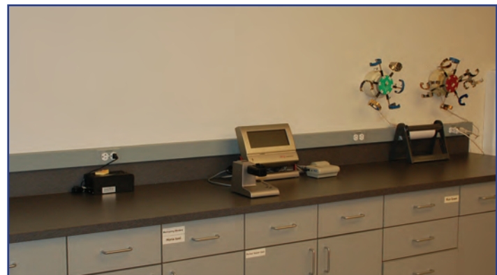
Figure 7: FINAL TEST AREA