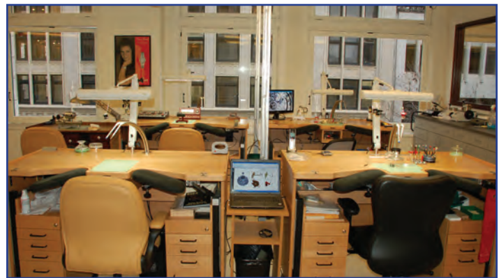
Figure 2: THE WORK AREA

boxes and trinkets, it may be hard for them to imagine you can keep the inside of their watch clean and that you can properly handle all the delicate parts. Nesbit says a 21 st century workshop "needs to be a clean, well-organized area to be productive—with all tools easily accessible. Everything needs its own place, so you don't waste time looking for that obscure tool you only use once or twice a month." (See Figures 2 and 3.)