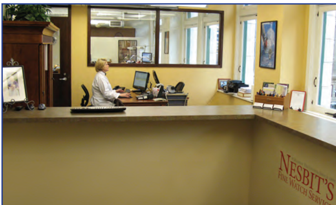
Figure 1: CUSTOMER ENTRANCE

According to Nesbit, the CW21 certification is industry-recognized and provides assurance to his customers. The 4-day examination includes theoretical, practical and micromechanical applications, which are skills all professional watchmakers should possess. However, he believes certification is much more than just a piece of paper to put on display; rather, it's a "way of life" for the contemporary watchmaker. In addition, the 21 st century watchmaker must make sure their appearance and the organization of their workshop reflects the quality and skill they put into every repair (Figure 1).